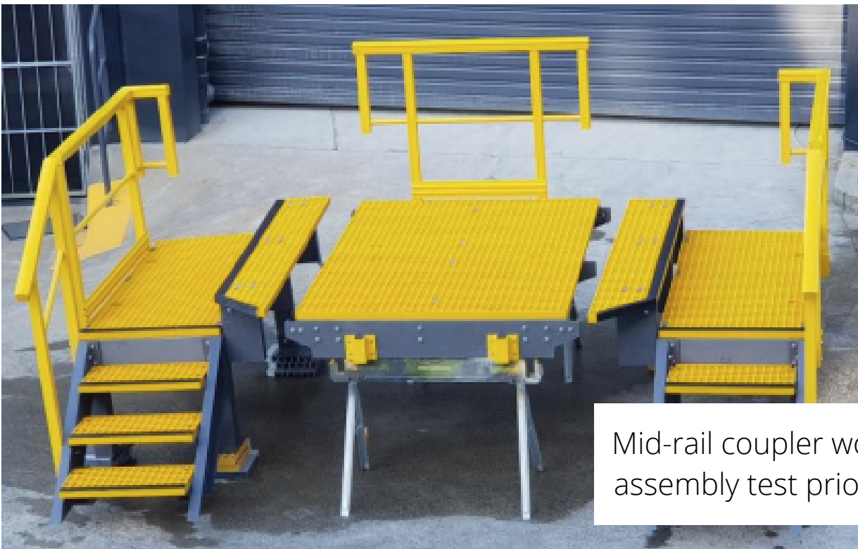
Mid-rail coupler work platform assembly test prior to delivery