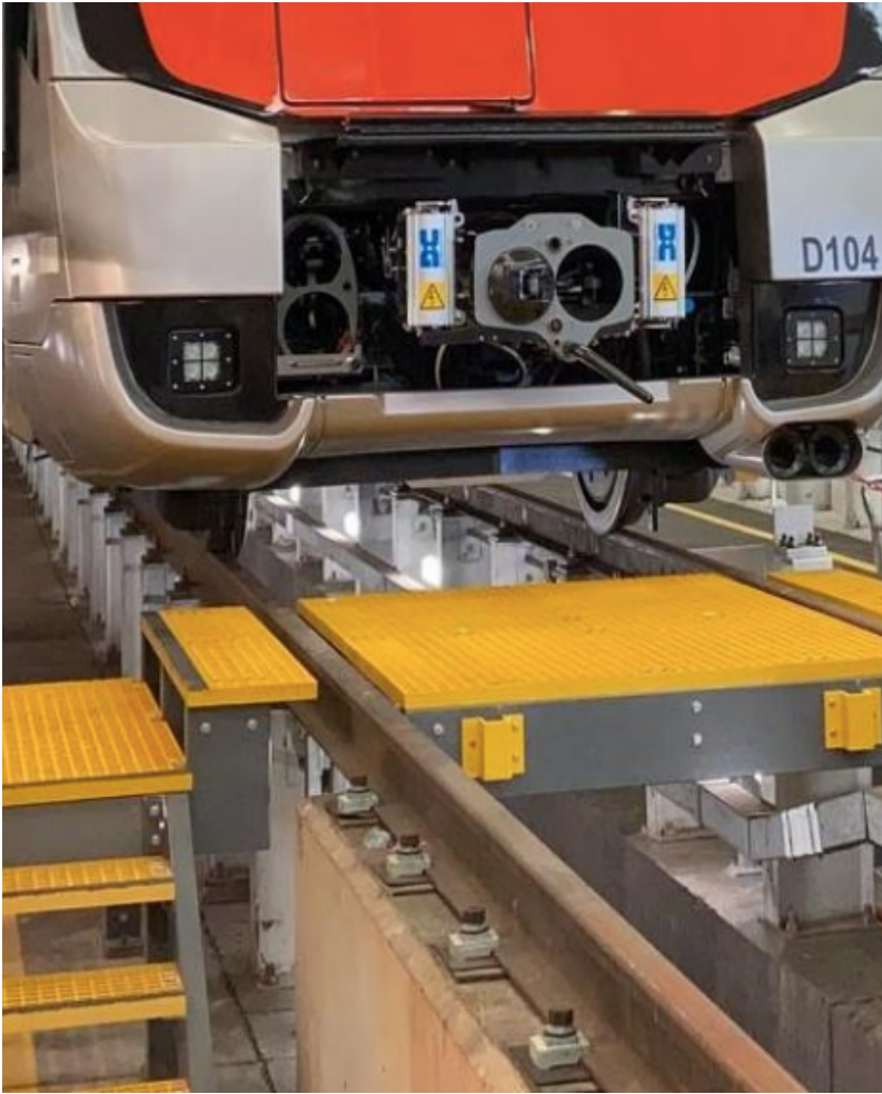
Mid-rail coupler work platform mid-handrail storage location