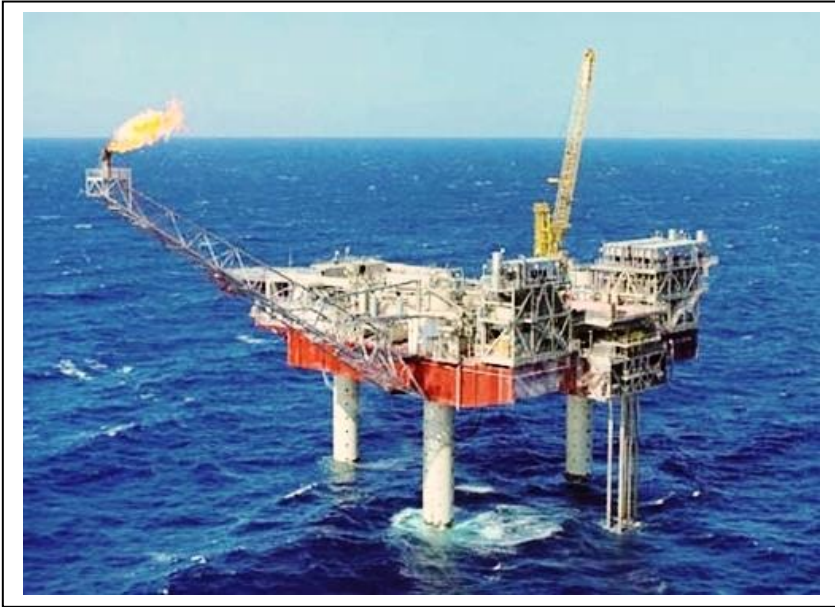
Ocean Legend Platform