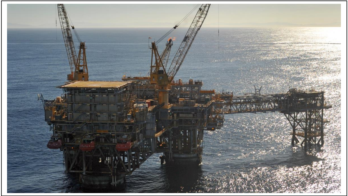
ExxonMobil, Kingfish – Bass Straight