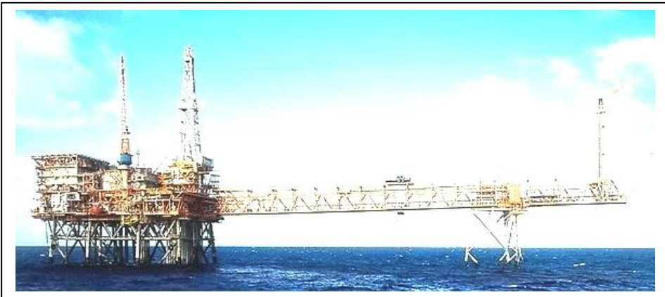
Woodside Pluto Platform